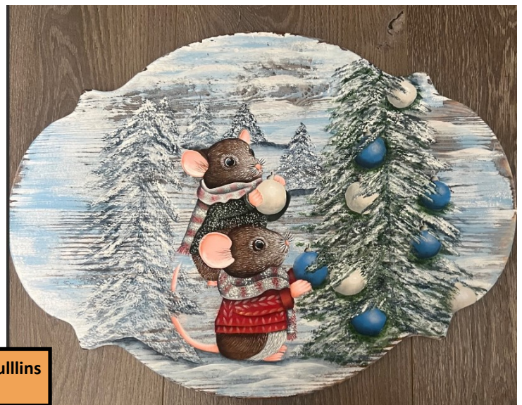
Our September program painted by Terri Mullins